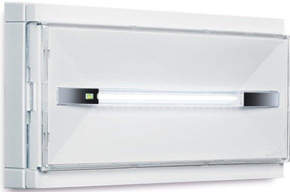
MODELLO DEPOSITATO / PATENTED DESIGN